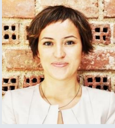
Değer Boden Boden Law

16 May 2019, The Graduate Institute Geneva, 14.00-18.30