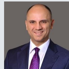
Noyan Göksu Göksu Aydın Attorneys at Law