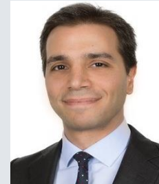
Tuvan Yalım Kabine Law Office